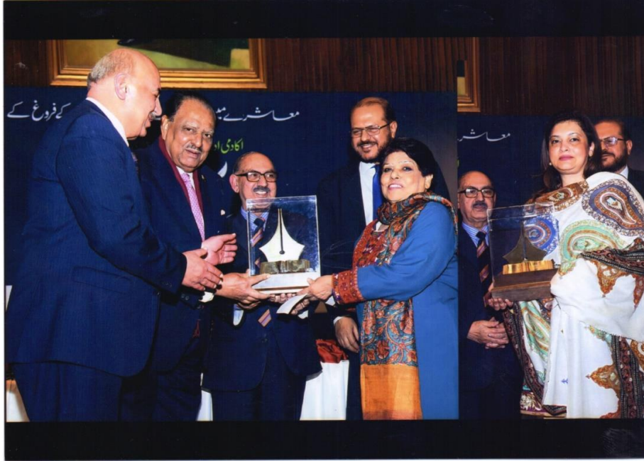
President of Pakistan Mr. Mamnoon Hussain graced the concluding session of 4 th International Conference on “Language, Literature and Society” organization by Pakistan Academy of Letters at Islamabad from January 5-8, 2017.