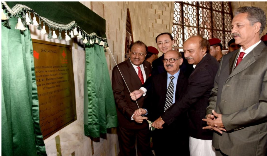
President Mamnoon Hussain inaugurating the newly installed Chandelier by unveiling the plaque at the Mazar-e-Quaid on 17/12/2016.