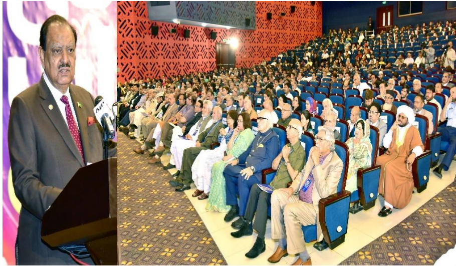
President Mamnoon Hussain addressing the Inaugural Ceremony of National Book Fair on the occasion of National Book Day at Pak-China Friendship Centre in Islamabad on April 22, 2017.